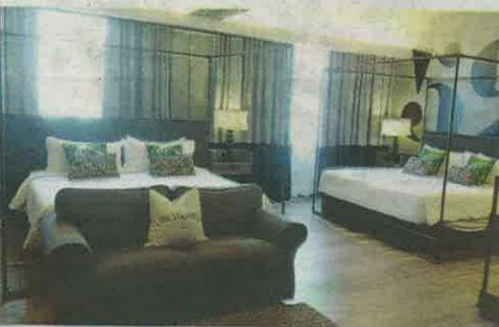
The spacious Family Suite.