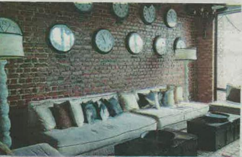
The waiting lounge at the ground floor of the hotel.

Laveda Charles is captivated by the instagram-worthy decor of this chic boutique hotel in Melaka