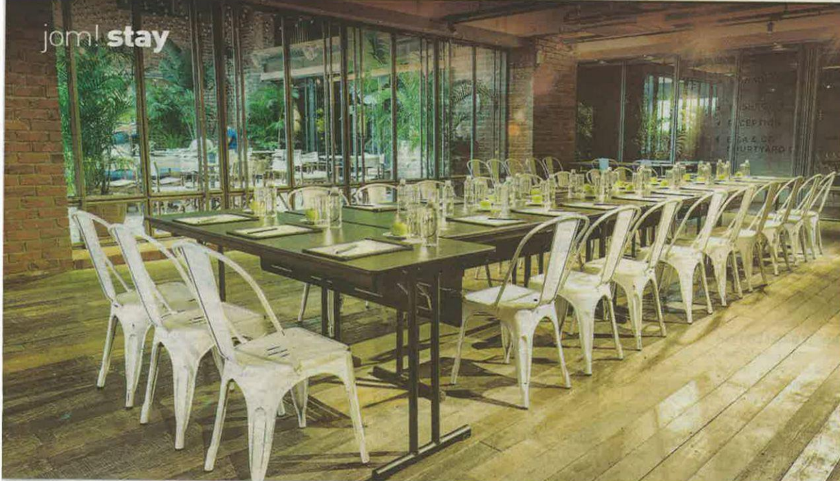
Rosa's meeting room right beside the courtyard.