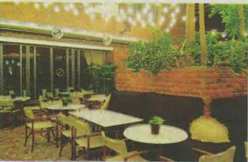
The beautiful lighted courtyard at night.